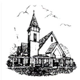
Holy Family Parish Altar Society

For questions, please call the Parish Office at 228-452-4686.