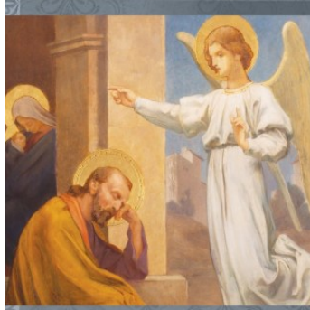
4TH SUNDAY OF ADVENT "Joseph, son of David, do not be afraid to take Mary your wife into your home." - Mt 1:20

December 21, 2025 The Fourth Sunday of Advent