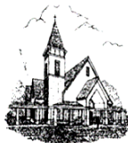
Holy Family Parish Altar Society

If you are interested in joining Holy Family's Altar Society, or want to learn more about us, please come and see!