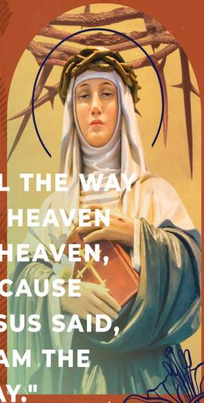
DOCTOR OF THE CHURCH

“ ALL THE WAY TO HEAVEN IS HEAVEN, BECAUSE JESUS SAID, "I AM THE WAY." ”