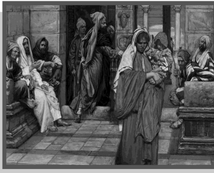
The Widow Who Gave Her Offering from the Treasury of Mark © 2001, 1986, 1981, 1976, 1975, 1970, 1965, 1960, 1955, 1950, 1945, 1940, 1935, 1930, 1925, 1920, 1915, 1910, 1905, 1900, 1895, 1890, 1885, 1880, 1875, 1870, 1865, 1860, 1855, 1850, 1845, 1840, 1835, 1830, 1825, 1820, 1815, 1810, 1805, 1800, 1795, 1790, 1785, 1780, 1775, 1770, 1765, 1760, 1755, 1750, 1745, 1740, 1735, 1730, 1725, 1720, 1715, 1710, 1705, 1700, 1695, 1690, 1685, 1680, 1675, 1670, 1665, 1660, 1655, 1650, 1645, 1640, 1635, 1630, 1625, 1620, 1615, 1610, 1605, 1600, 1595, 1590, 1585, 1580, 1575, 1570, 1565, 1560, 1555, 1550, 1545, 1540, 1535, 1530, 1525, 1520, 1515, 1510, 1505, 1500, 1495, 1490, 1485, 1480, 1475, 1470, 1465, 1460, 1455, 1450, 1445, 1440, 1435, 1430, 1425, 1420, 1415, 1410, 1405, 1400, 1395, 1390, 1385, 1380, 1375, 1370, 1365, 1360, 1355, 1350, 1345, 1340, 1335, 1330, 1325, 1320, 1315, 1310, 1305, 1300, 1295, 1290, 1285, 1280, 1275, 1270, 1265, 1260, 1255, 1250, 1245, 1240, 1235, 1230, 1225, 1220, 1215, 1210, 1205, 1200, 1195, 1190, 1185, 1180, 1175, 1170, 1165, 1160, 1155, 1150, 1145, 1140, 1135, 1130, 1125, 1120, 1115, 1110, 1105, 1100, 1095, 1090, 1085, 1080, 1075, 1070, 1065, 1060, 1055, 1050, 1045, 1040, 1035, 1030, 1025, 1020, 1015, 1010, 1005, 1000, 995, 990, 985, 980, 975, 970, 965, 960, 955, 950, 945, 940, 935, 930, 925, 920, 915, 910, 905, 900, 895, 890, 885, 880, 875, 870, 865, 860, 855, 850, 845, 840, 835, 830, 825, 820, 815, 810, 805, 800, 795, 790, 785, 780, 775, 770, 765, 760, 755, 750, 745, 740, 735, 730, 725, 720, 715, 710, 705, 700, 695, 690, 685, 680, 675, 670, 665, 660, 655, 650, 645, 640, 635, 630, 625, 620, 615, 610, 605, 600, 595, 590, 585, 580, 575, 570, 565, 560, 555, 550, 545, 540, 535, 530, 525, 520, 515, 510, 505, 500, 495, 490, 485, 480, 475, 470, 465, 460, 455, 450, 445, 440, 435, 430, 425, 420, 415, 410, 405, 400, 395, 390, 385, 380, 375, 370, 365, 360, 355, 350, 345, 340, 335, 330, 325, 320, 315, 310, 305, 300, 295, 290, 285, 280, 275, 270, 265, 260, 255, 250, 245, 240, 235, 230, 225, 220, 215, 210, 205, 200, 195, 190, 185, 180, 175, 170, 165, 160, 155, 150, 145, 140, 135, 130, 125, 120, 115, 110, 105, 100, 95, 90, 85, 80, 75, 70, 65, 60, 55, 50, 45, 40, 35, 30, 25, 20, 15, 10, 5, 0.