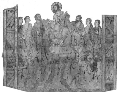
Detail, Anonymus, Christ Teaching , Anglo-Saxon, c. 1000

We live in a society that has many technological avenues for stimulation and entertainment, one in which the urban population exceeds the non-urban. It is curious that loneliness is a prevalent malady. It is easy to reach out and touch someone, we are told. But—in truth—it is not all that easy, and statistics from the mental health field will reinforce that opinion. Today's readings are about the ways in which we can authentically reach out: God touches Adam to create a mate and end his solitude; God-in-Jesus takes on human flesh and death in order that we might come to glory; Jesus reaches out to the children whom the disciples had tried to keep away, showing us the manner in which we must approach the loving embrace that awaits us in heaven. Until that day, however, we must remember that ours is a sacramental church, a church of signs of the love of God. And so we are called to reach out continually to ease the loneliness and the barriers that separate us from one another and, therefore, from the love of Christ.