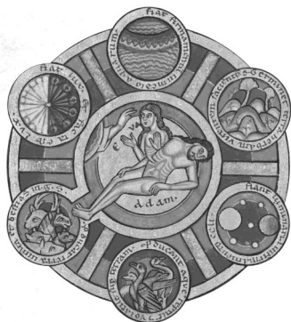
Detail, Anonymous, The Creation of the World , Germany, c.1170s

We live in a society that has many technological avenues for stimulation and entertainment, one in which the urban population exceeds the non-urban. It is curious that loneliness is a prevalent malady. It is easy to reach out and touch someone, we are told. But—in truth—it is not all that easy, and statistics from the mental health field will reinforce that opinion. Today's readings are about the ways in which we can authentically reach out: God touches Adam to create a mate and end his solitude; God-in-Jesus takes on human flesh and death in order that we might come to glory; Jesus reaches out to the children whom the disciples had tried to keep away, showing us the manner in which we must approach the loving embrace that awaits us in heaven. Until that day, however, we must remember that ours is a sacramental church, a church of signs of the love of God. And so we are called to reach out continually to ease the loneliness and the barriers that separate us from one another and, therefore, from the love of Christ.